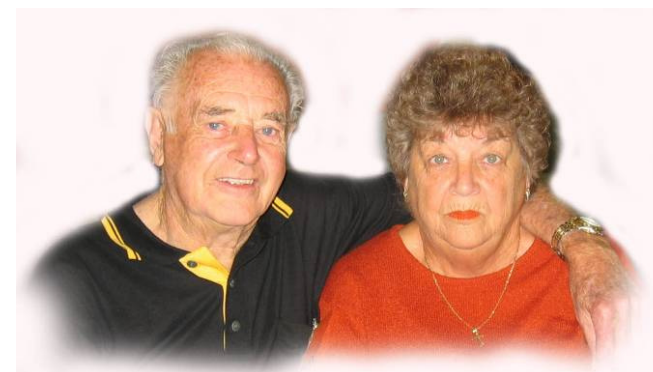
It goes to show that Country Music sure can bring a sparkle to ones eyes.